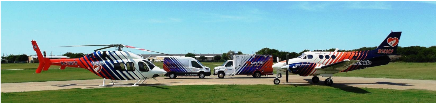
CareFlite: America's Oldest Joint Use Air Medical Service, America's Youngest EMS Helicopter Fleet

CareFlite will be offering free CPR training during 2017. Visit CareFlite.org for more information.